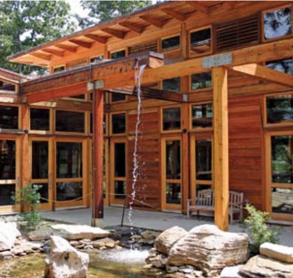
THE BERNHEIM ARBORETUM AND RESEARCH VISITORS CENTER IN CLERMONT, KY., WAS AWARDED THE "OUTSTANDING ACHIEVEMENT AWARD FOR BEST GREENHOUSE GAS REDUCTION."