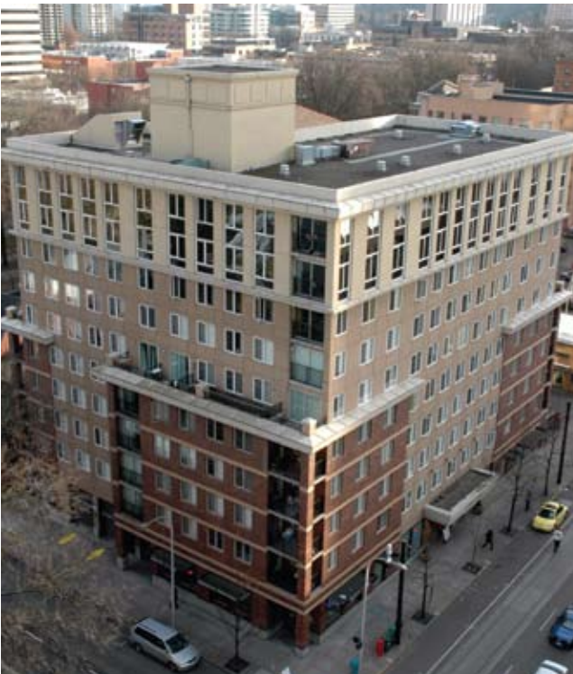
ST. JAMES APARTMENTS IN DOWNTOWN PORTLAND, ORE.

Visit www.nmhc.org for more information.