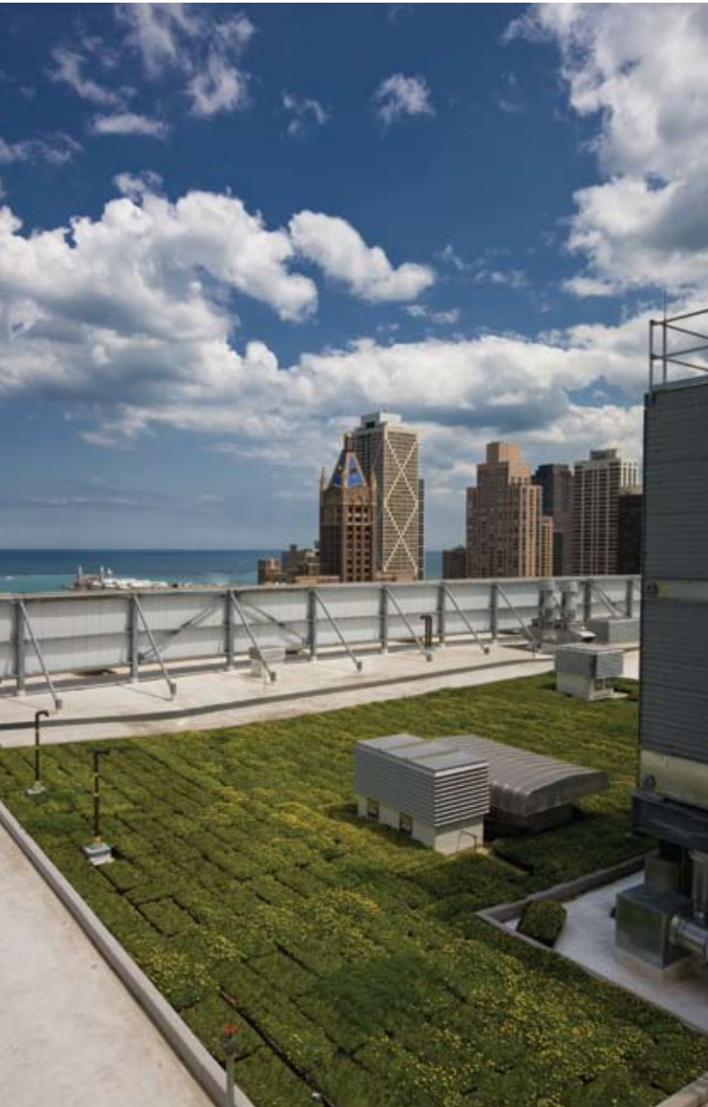
PRENTICE WOMEN'S HOSPITAL IN CHICAGO, DESIGNED AS A JOINT VENTURE BY THE VOA ASSOCIATES INCORPORATED + OWP/P DESIGN COLLABORATIVE, OPENED IN OCTOBER 2007 AND RECENTLY ACHIEVED LEED NC-SILVER CERTIFICATION.