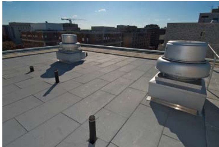
NON-VEGETATIVE GREEN ROOF ATOP BON WIT PLAZA IN WASHINGTON, D.C.

The non-vegetative roofing system utilizes a coal tar-based waterproofing membrane and environmentally friendly insulation to achieve optimum performance and sustainability.