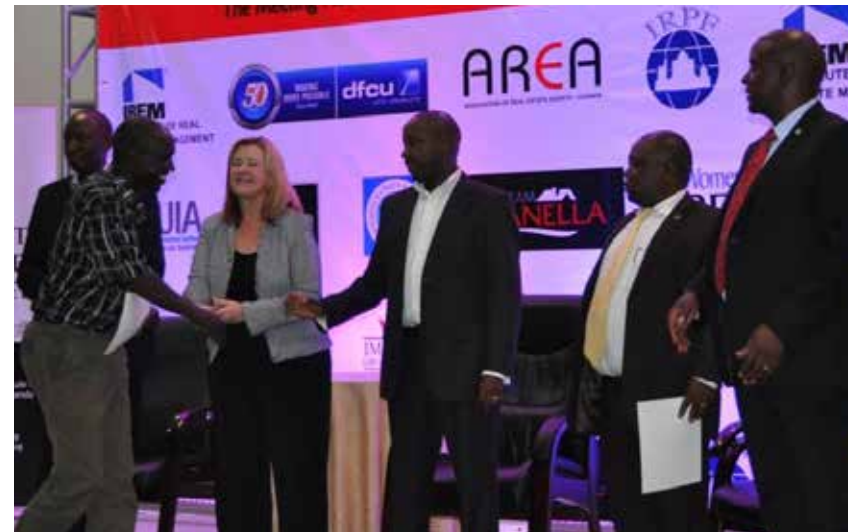
Participants Receiving Certificates

Uganda's Third Real Estate Conference was a great success because it convened important stakeholders to find ways to offer affordable housing options, provided the rationale for women to enter the real estate industry as leaders and practitioners, reinforced the value of women's knowledge of property rights, and reminded the audience of the power of real estate SMEs as engines for growth.