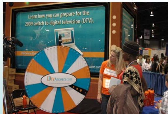
DTV Trekker stop at NBC 4 Fitness Expo in Washington, DC